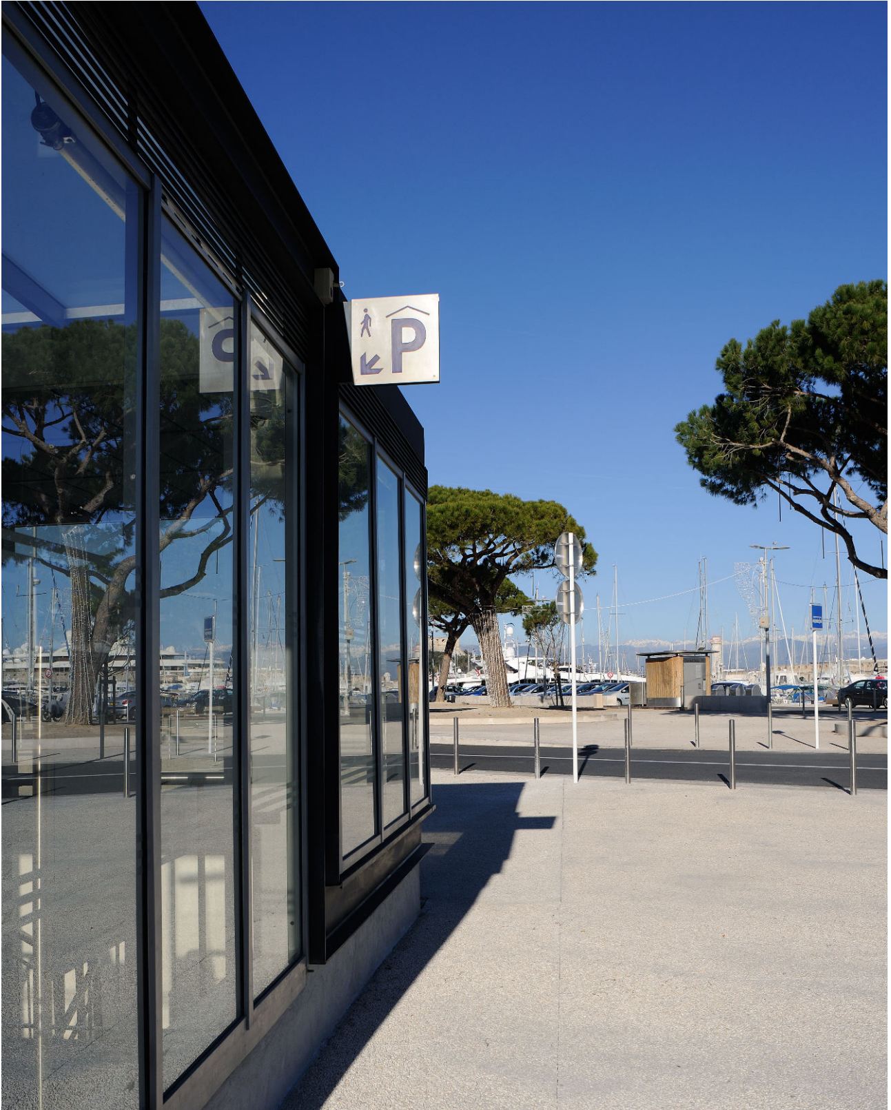
Pré des Pêcheurs, Antibes, France, winner of the EPA 2015 special jury prize